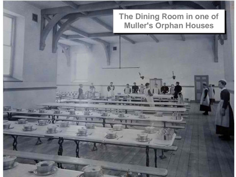
The Dining Room in one of Muller's Orphan Houses