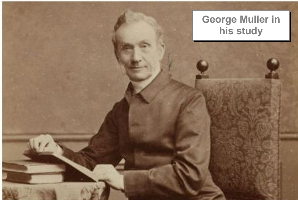
George Muller in his study