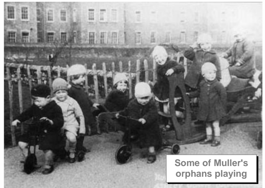
Some of Muller's orphans playing