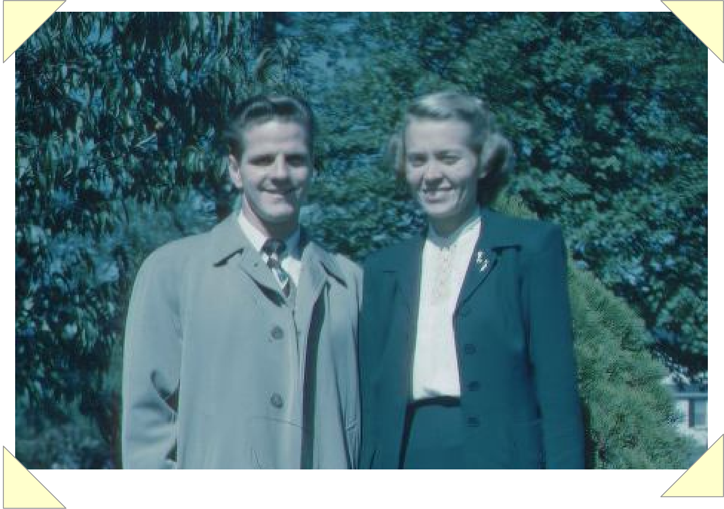
Picture of Jim and Elisabeth Elliot