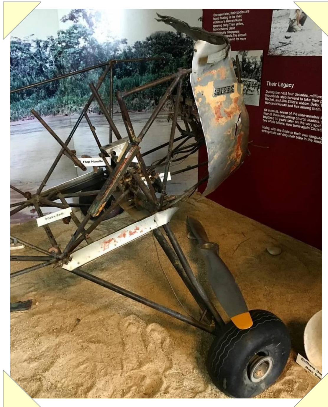
Remains of Five Missionaries' Plane Located at the MAF Headquarters