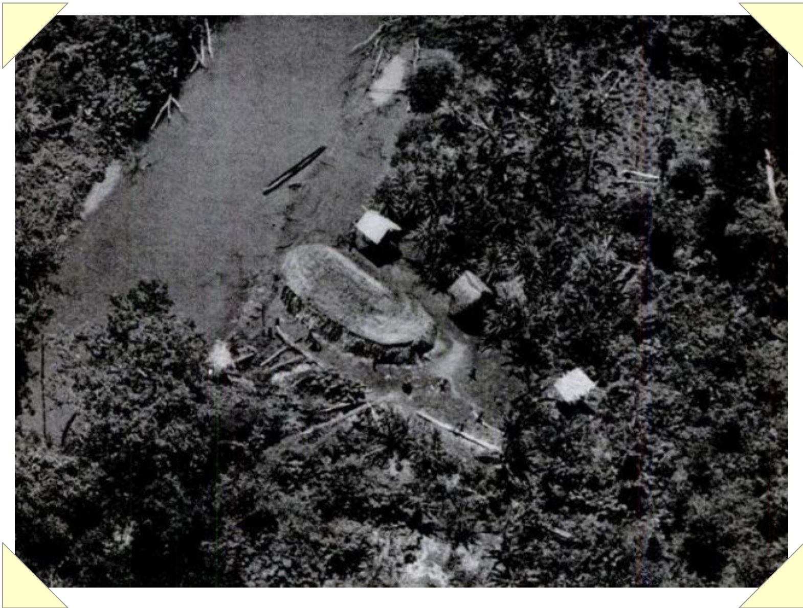
Photo Taken from the Plane of the Auca Village