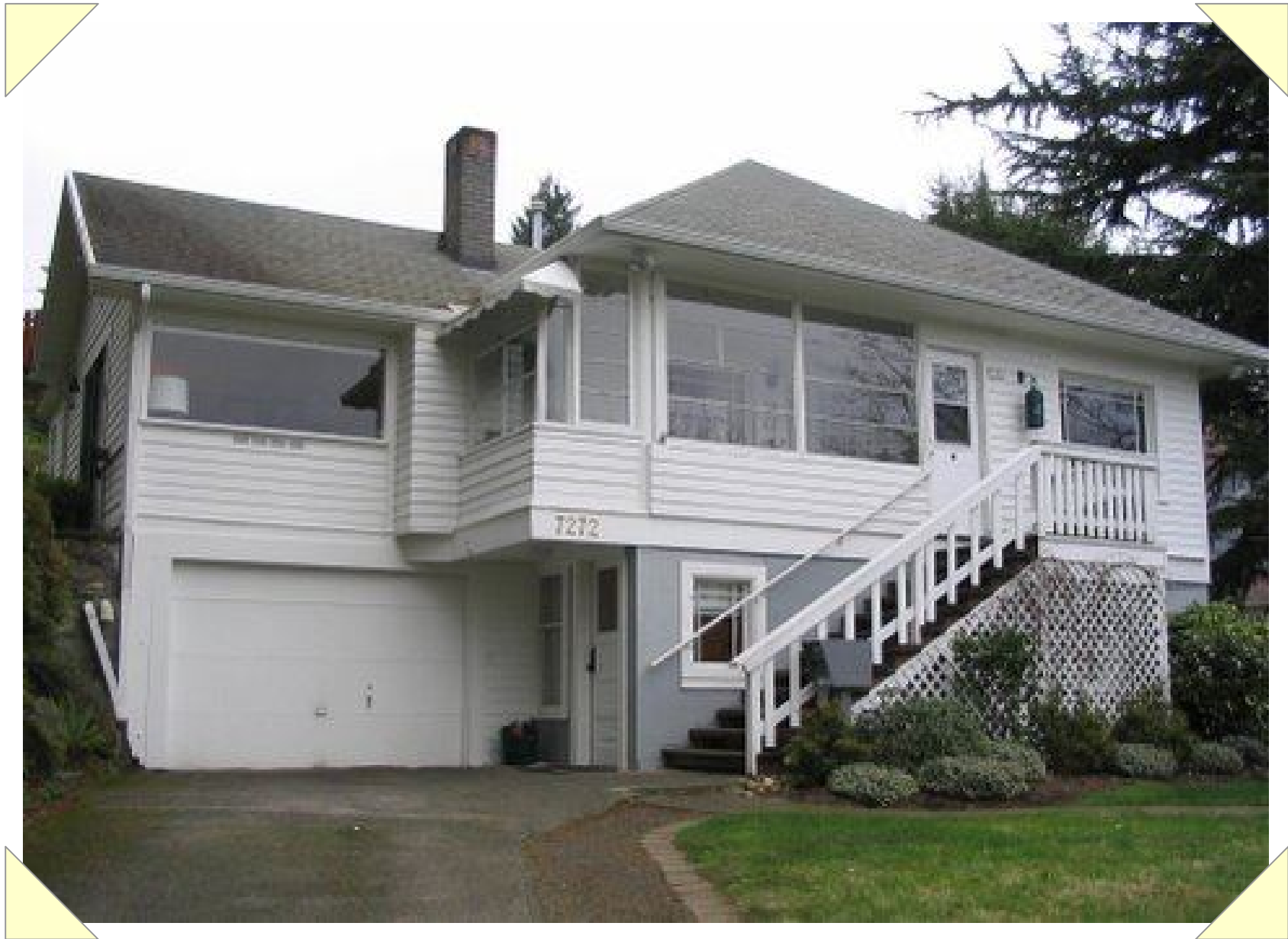
Current Picture of the Elliot's Home