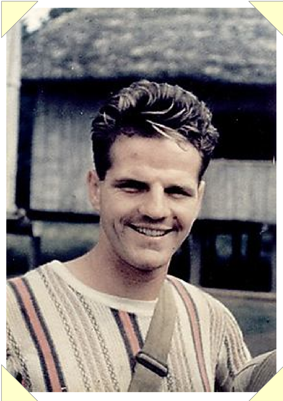
Picture of Jim Elliot working in South America Before Working with the Aucas