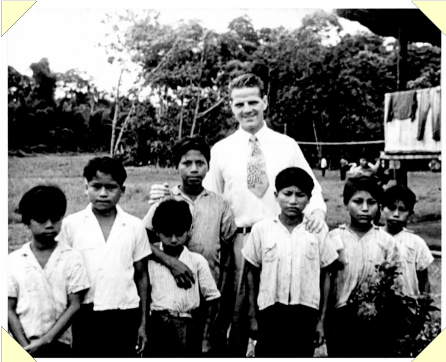
Jim Elliot with a Group of Sunday School Boys on the Mission Field