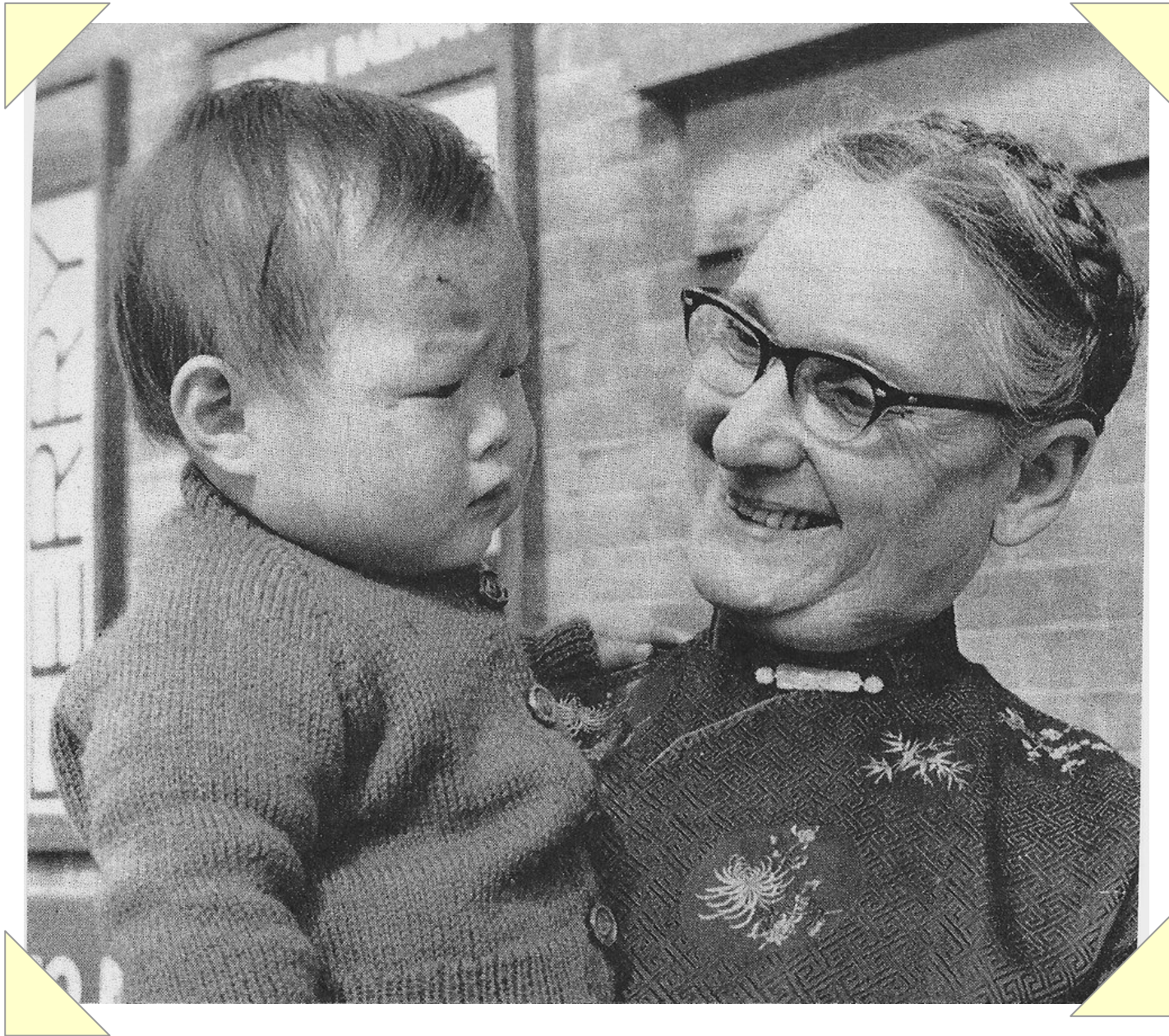
Gladys Aylward with a Child