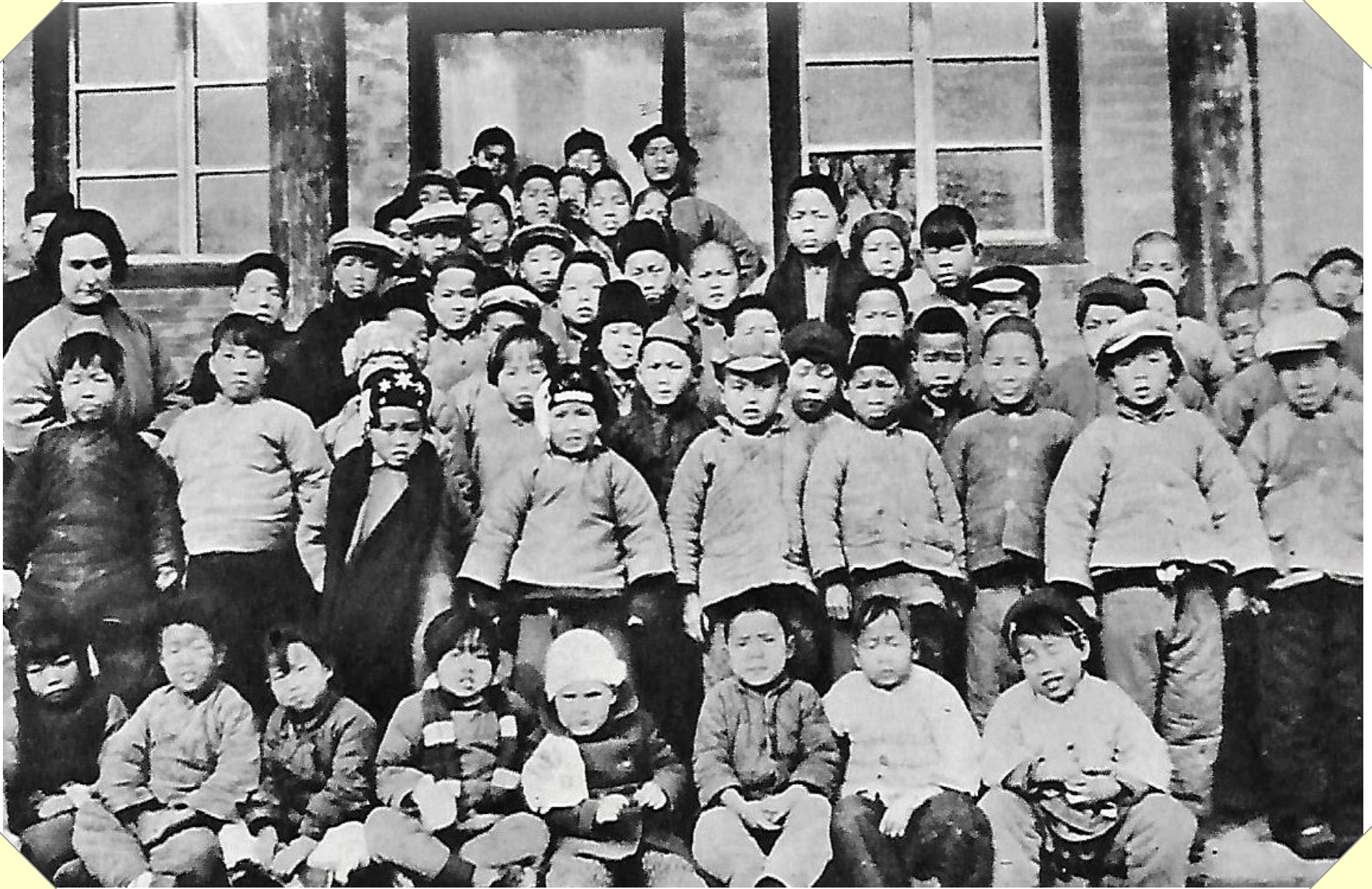
Gladys Aylward with Some of Her Children before Crossing the Mountains to Sian