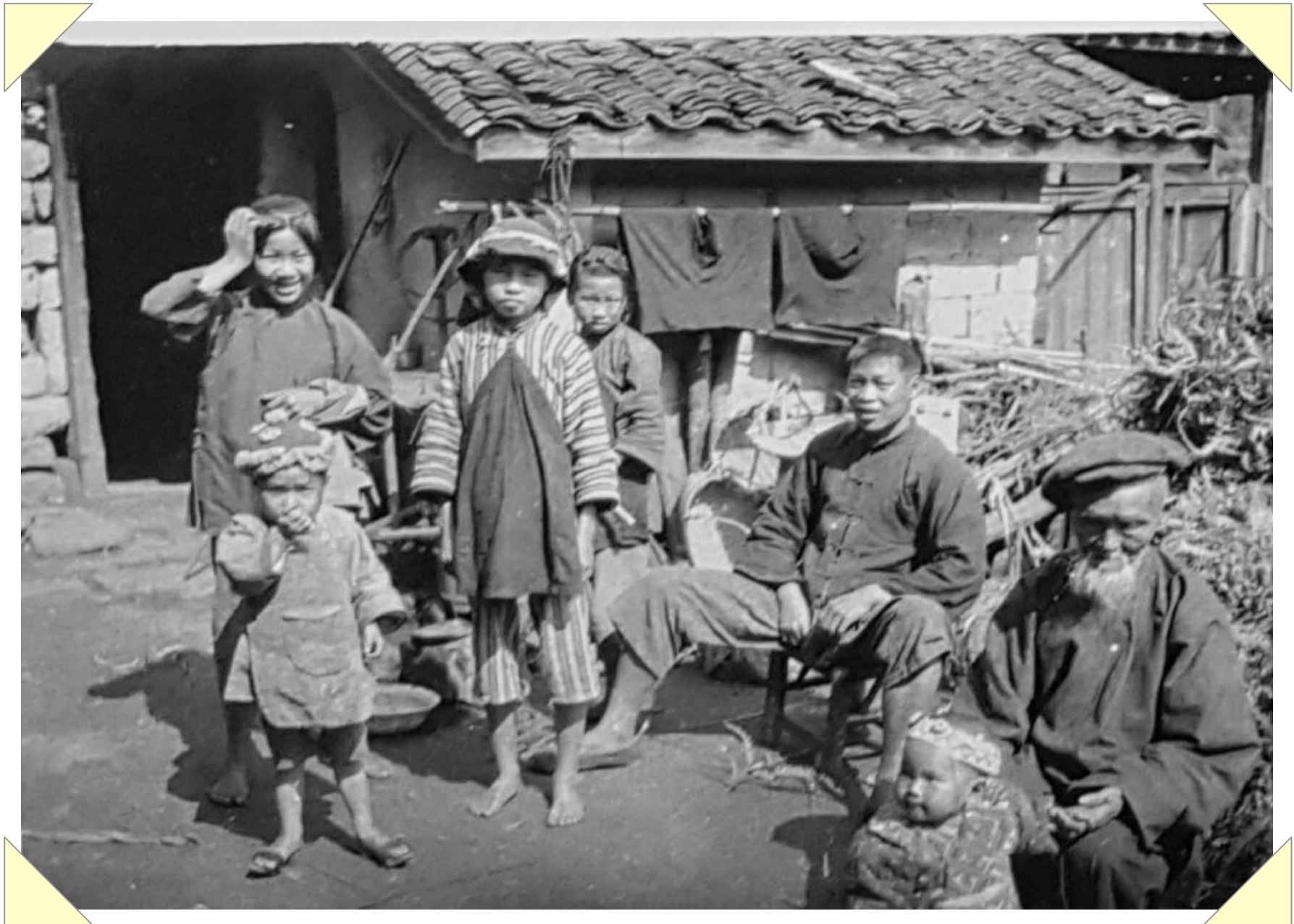
Some Chinese People at the Inn of Sixth Happiness