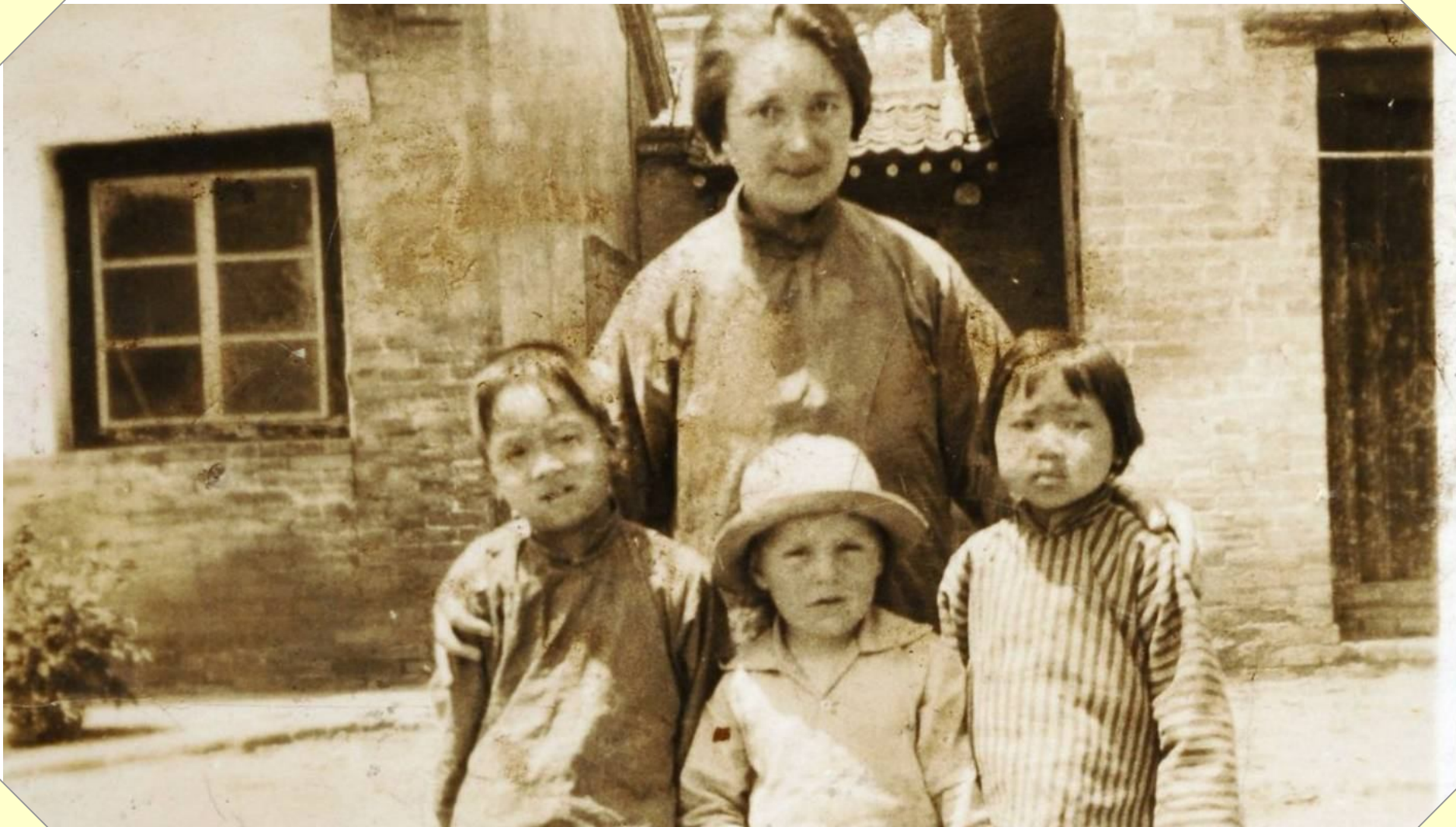
Gladys Aylward with Some Children in Yangchen, China, 1936