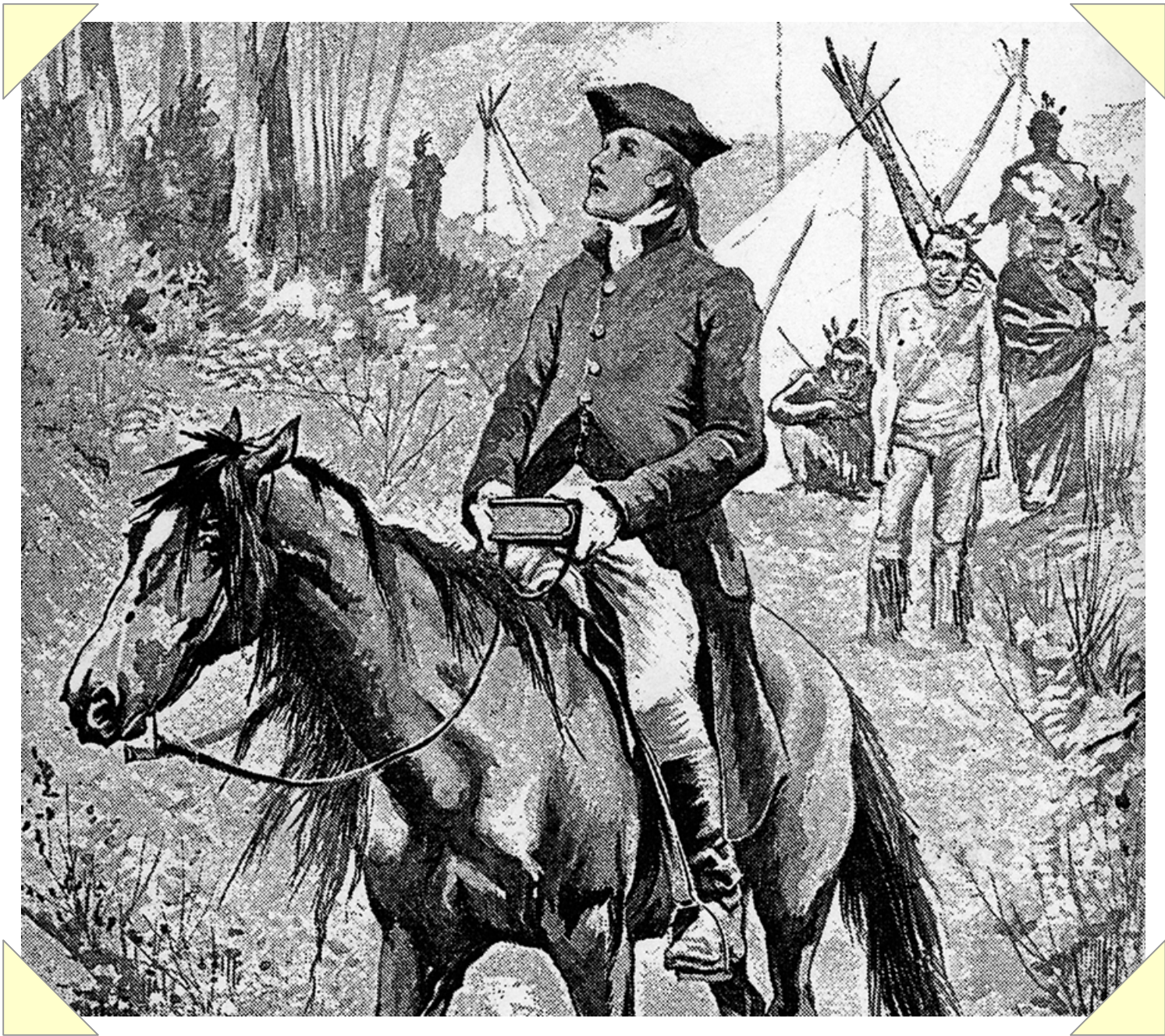
Drawing of David Brainerd Working with the Indian People