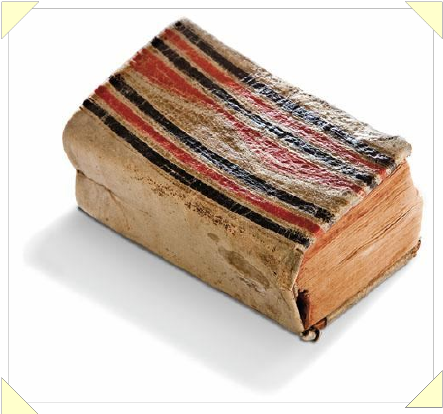
Hebrew Lexicon Found in David Brainerd's Saddlebag