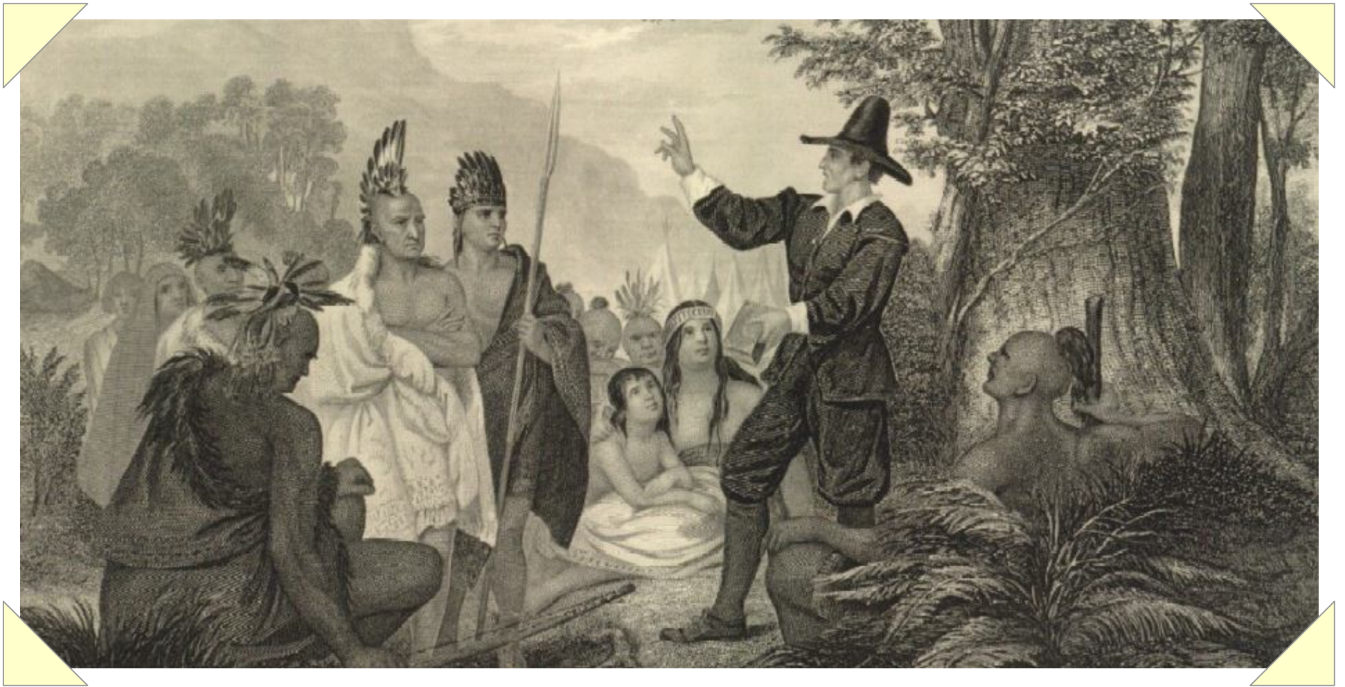
Drawing of David Brainerd Preaching to an Indian Tribe