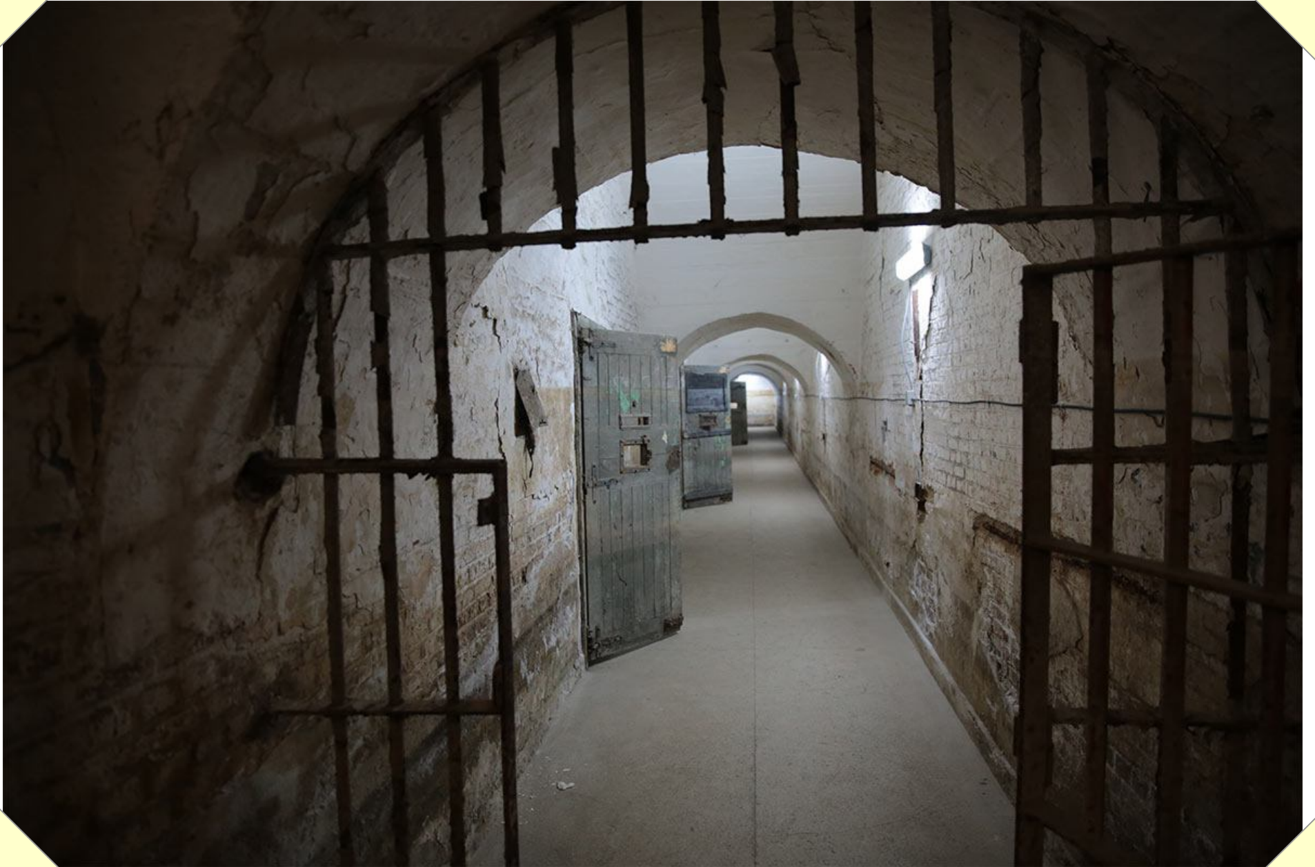
Prison Where Richard Wurmbrand was Kept