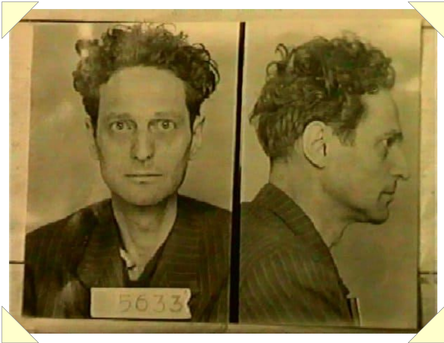
Richard Wurmbrand Arrested for Standing against Communism and Preaching