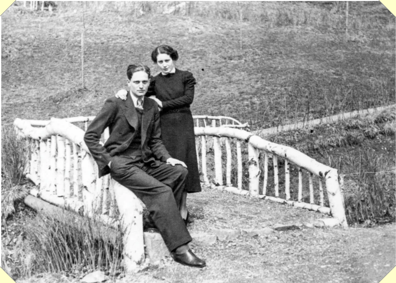
Richard and Sabina Wurmbrand in Romania